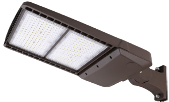
620003-NW-US 200 W 620004-NW-US 300 W