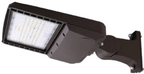
620001-NW-US 100 W 620002-NW-US 150 W